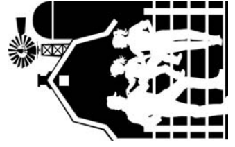
Figure 1. Avian Influenza Evolution and Transmission