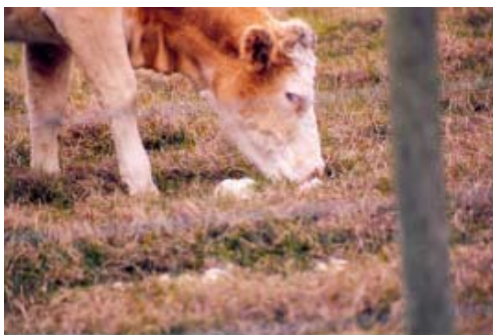
Figure 2. Cow ingesting sludge product

Stockpiling of any sludge or sludge product should be avoided when possible. Any unavoidable stockpiling should be where odors will not be a concern. Sometimes odors can be strong. If you do stockpile, be sure the pile is located on a well drained site so water does not pond and locate where any rainfall runoff will not immediately enter a water body (ditch, stream, pond).