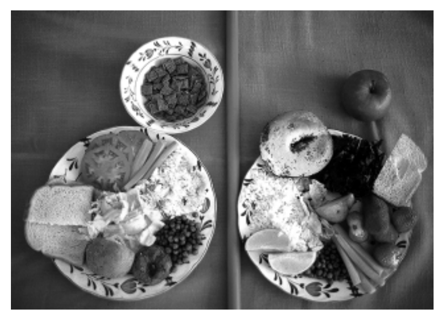
Figure 2. Diet Used in the Part 503 Risk Assessment Compared to USDA Recommended Daily Vegetable Intake

Left: Daily vegetable, fruit and grain in diet used in the 503 risk assessment